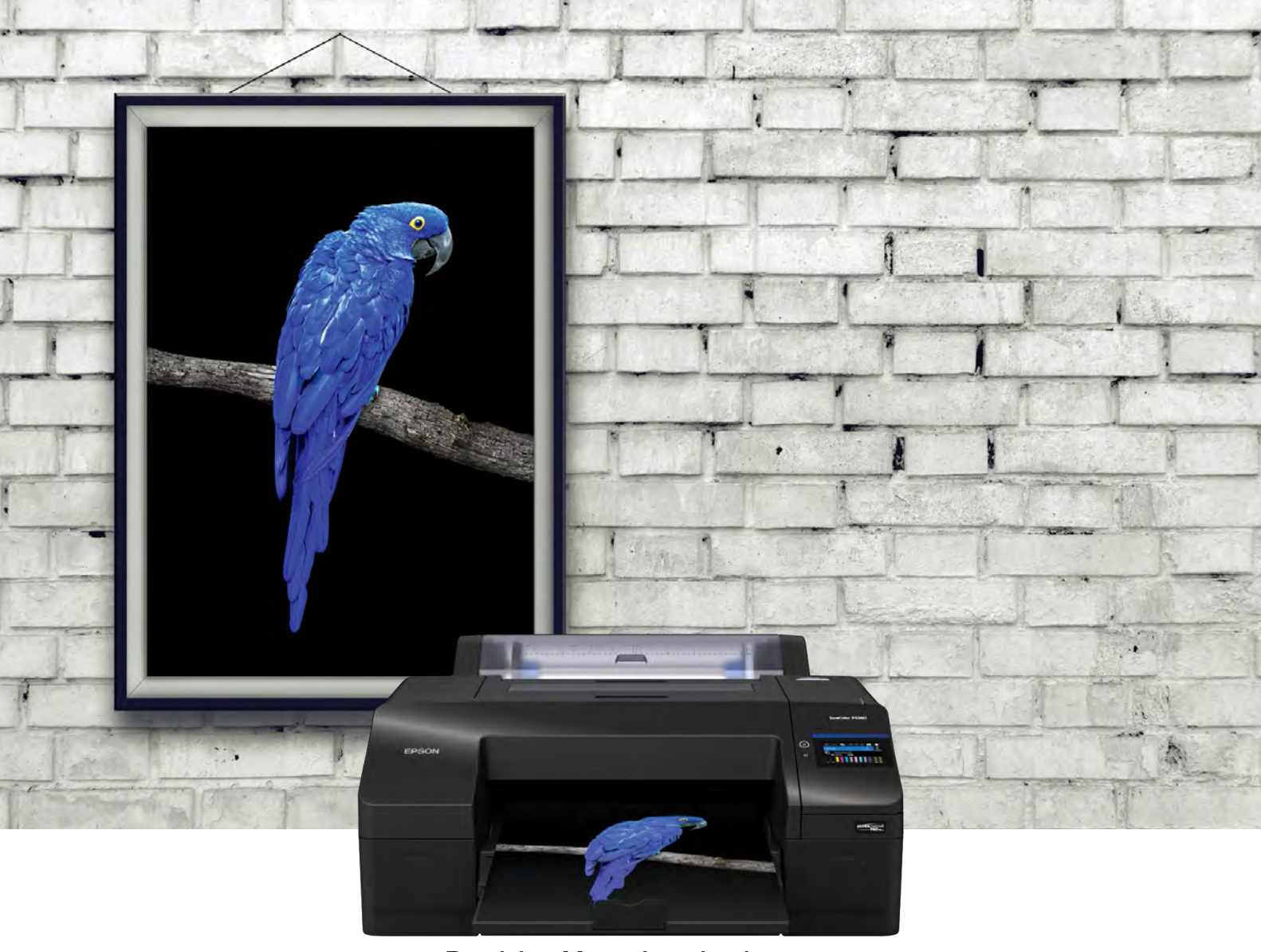
Precision Meets Imagination